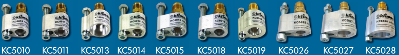
KC5010 KC5011 KC5013 KC5014 KC5015 KC5018 KC5019 KC5026 KC5027 KC5028